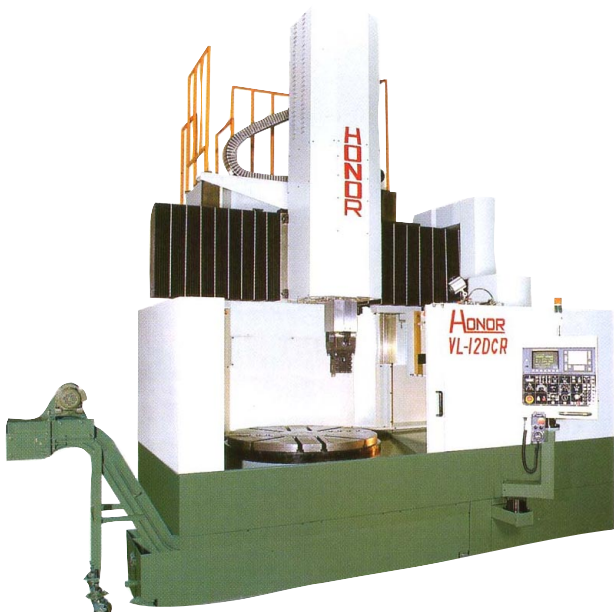
VL - 12DCR